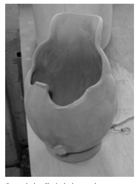
Seen on the day... Here's what happens when you pass a "green" pot around some forty members who aren't used to handling them. And this was one of the previously-cast pieces which had been in the mould for two days. Remember what we said about delicacy of touch? The fettlers would be taking pieces out of the moulds after only half an hour or so. And, needless to say, they wouldn't have been paid for a piece in this condition!