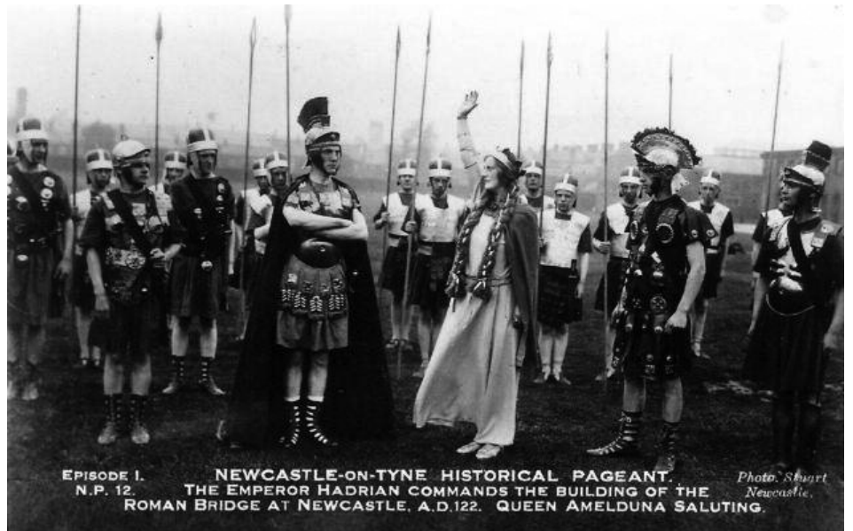
EPISODE 1. NEWCASTLE-ON-TYNE HISTORICAL PAGEANT. N.P. 12. THE EMPEROR HADRIAN COMMANDS THE BUILDING OF THE ROMAN BRIDGE AT NEWCASTLE, A.D. 122. QUEEN AMELDUNA SALUTING.

Official photographers, Stuart of Blackett Street, were to have a kiosk on the Pageant ground and official caterers Tilleys of Blackett Street, a marquee. The Pageant was divided into six special days. Monday, July 20 th was Civic Day and opened by The Lord Mayor of Newcastle upon Tyne, Alderman David Adams. Tuesday, July 21 st , Durham County Day, opened by The Marquis of Londonderry. Wednesday, July 22 nd , Northumberland County Day, opened by The Earl Grey.