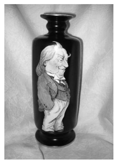
Can anyone help to identify this gentleman?