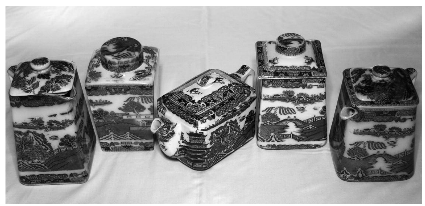
Buyer beware.! The caddy second from left has been known to be faked.