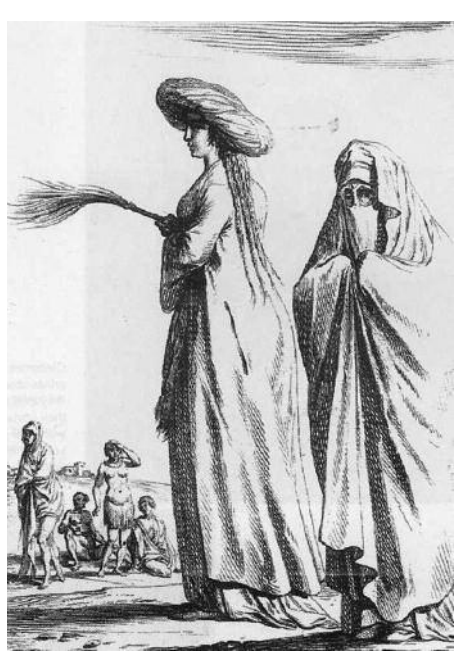
Illustration from Denon's "Travels in Upper and Lower Egypt".