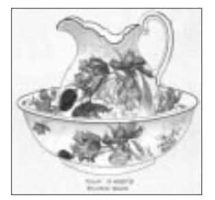
Tulip - 4057

patterns!) to photograph ALL Maling designs and record their pattern numbers. This is where we need your help. If you have any examples of Maling ware with a pattern number EARLIER than 6300 (in the 1920-1963 sequence) or ANY pre 1920 pattern number ranging from 1-9999, we would like a photograph of the design and a note, or better still a picture of the number. Please also make a note if a pattern name is included in the mark.