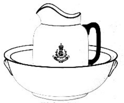
970 Ivory Body, Armstrong Shape, Handled Basin