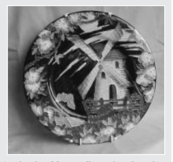
plate placed atop the Maling plaque/service plate. Many small vases in embossed Peona etc. were made to go with such table settings."

"A 'service plate' is actually the American/Canadian equivalent of a 'lay plate' and not a dinner plate. The place would be set at the table with a service plate and a dinner