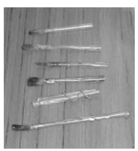
A brush from the past.