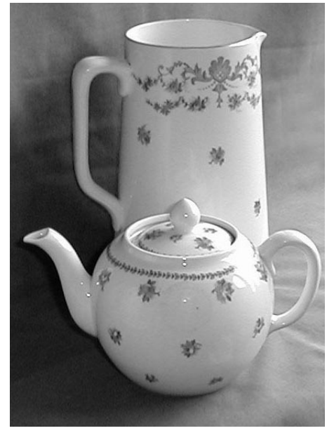
The occasional little find can open up whole new lines of enquiry.

Take this teapot which was, to put it bluntly, stolen (but not by me!). At one stage it carried a logo or inscription which has been sandpapered off to leave a large rough patch on the glaze. It's just possible to make out the words "Refreshment Department", but the key word which might identify the source has been obliterated.